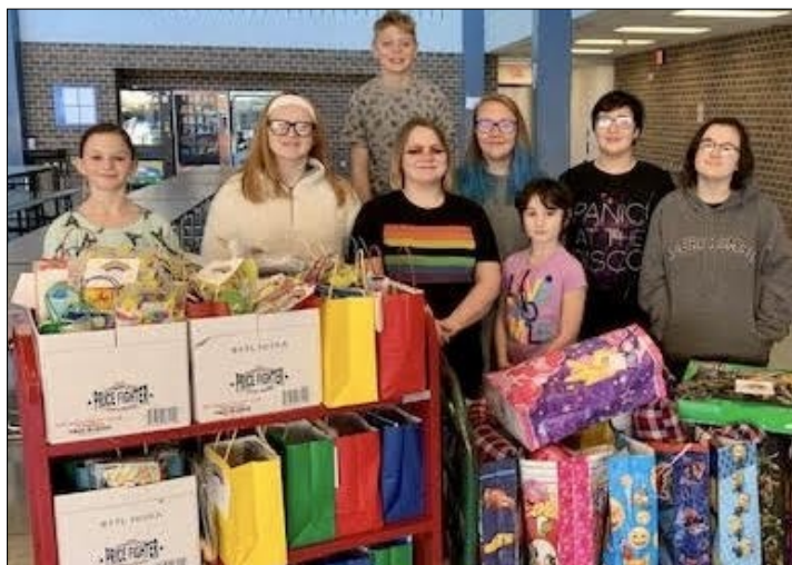
At Strayer Middle School, the Gay Straight Alliance, through donations from the school community, made 90 care packages for children unexpectedly admitted to Grand View Hospital.