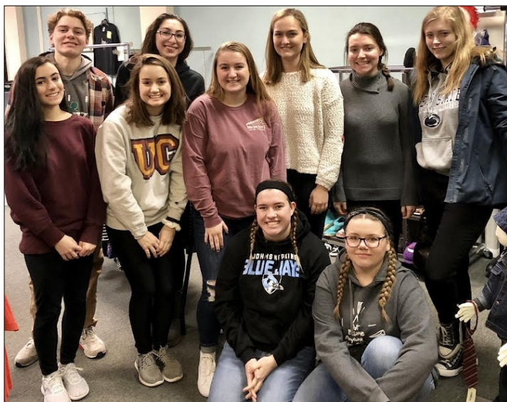
Quakertown Community High School students spent their day of service at the Hope ReStored Thrift Shop.