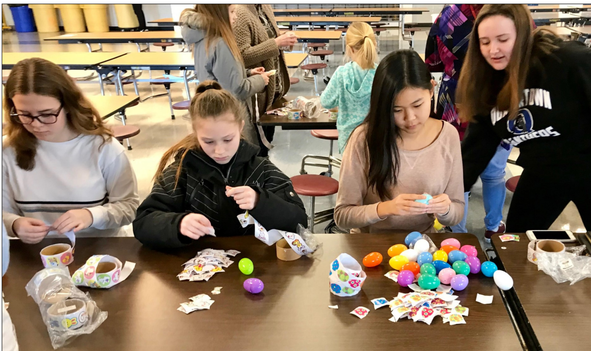
Students in the high school cafeteria work to fill eggs for Quakertown Borough's Easter egg hunt during Monday's MLK Day of Service.